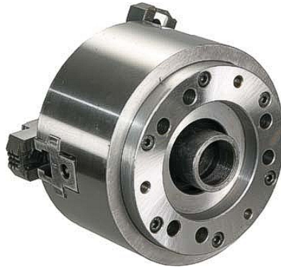
Type 7600 (Power Chuck Eccentric Compensation / Jaw Compensation Direct Mount)

Standard Accessories: Reversible Top hard Jaws- 1 Set Soft Jaws- 1 Set Allen Key- 1 Pc Key for Stroke Adjustment - 1 Pc (only in open Center)